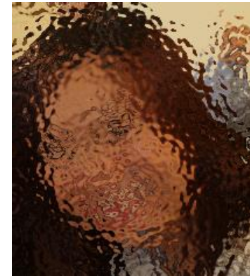
Vacant Senior Staff Accountant