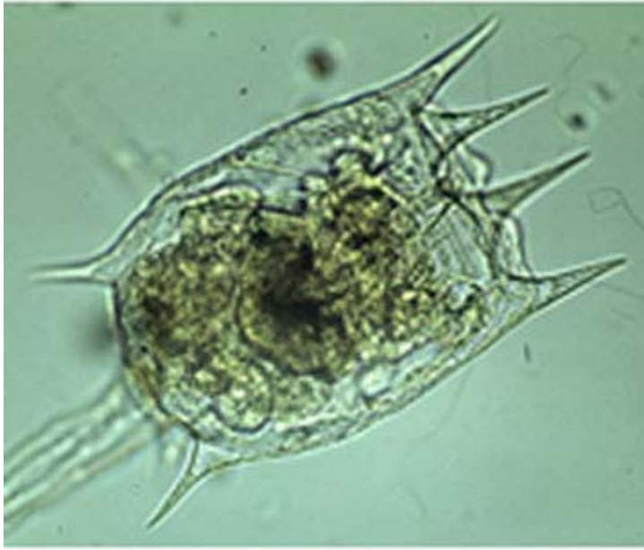
Figure 2. Brachionus calyciflorus , a fresh-water rotifer.

Another incident that comes to mind concerns my interest in statistics. I had become interested in applied statistics and experimental design in my work at McGill. When I came to Dartmouth in 1972, I worked on rotifer developmental biology 8 but I made a point of helping fellow graduate students and eventually professors with their statistical needs. At one point, my research director criticized me for spending time on statistics. He felt that this activity was distracting from my experimental work and was a side issue. I argued strongly that applied statistics was an important component of my future career and that helping others was a useful way of deepening my own knowledge as well as serving the interests of the department. My