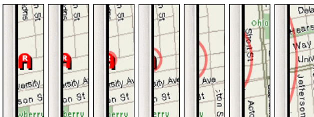
Figure 3: As this location is panned out of the display window, a ring emerges from its center. The ring grows as the location is panned further away.