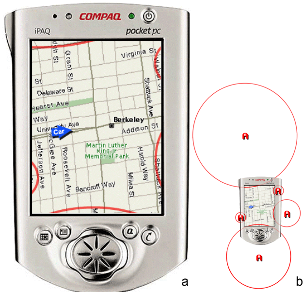
Figure 2: (a) Enhancing the map from Figure 1 with Halo shows where in off-screen space the five restaurants are located. (b) How it works: each off-screen location is located in the center of a ring that reaches into the display window.

which is especially important for map-related tasks. Unlike techniques that use arrows to point to off-screen locations (such as City Lights [4]), Halo provides full information about the location of off-screen objects, not only their direction.