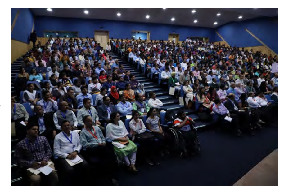
ACM Annual Day 2018