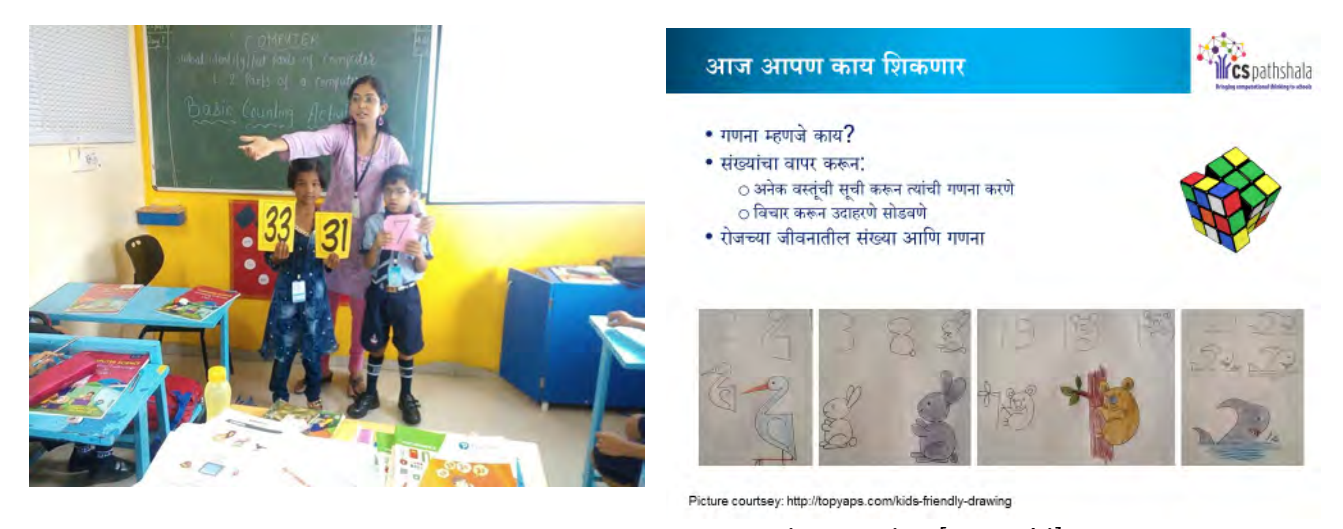
Towers of Hanoi [Decomposition & Patterns] Systematic Counting [Marathi] Systematic Counting

A subset of these have been translated into Gujarati, Hindi and Marathi.