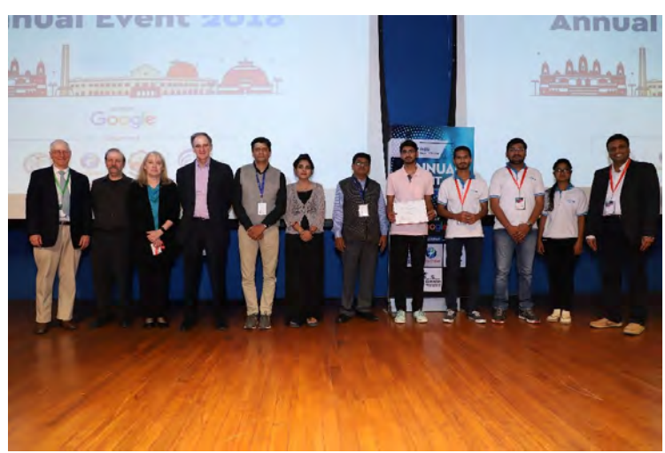
Event Organizers from YCCE