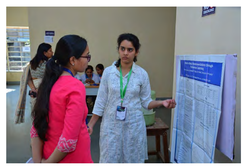
Poster Presentation IRISS 2018

ACM Annual Day 2018 was held on 17th Feb at Persistent Systems Ltd. This included best doctoral dissertation and best student chapter awards distribution, followed by keynotes from various eminent speakers.