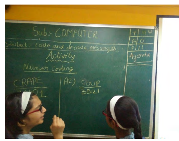
Encoding [Information Processing]

education to 300 million students. Compare that with about 130,000 schools in the USA with 54 million students. To compound the problem, India has over 50 education Boards!